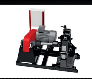
EMK ELECTRIC MOTOR KIT Cradle options for several electric motors ranging 55/75 kW.