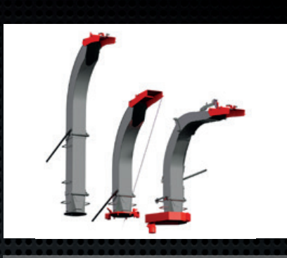
OPTIONAL DISCHARGE PIPES Rectric Rectric Rectric OPTIONAL DISCHARGE PIPES